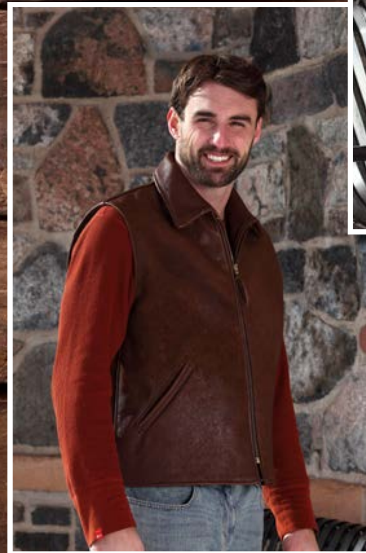
Brown Men's 26" Slender-Style Vest Wing Collar, No Yoke, Slash Pockets, Zipper 3-4 Deer or 1 Elk $395