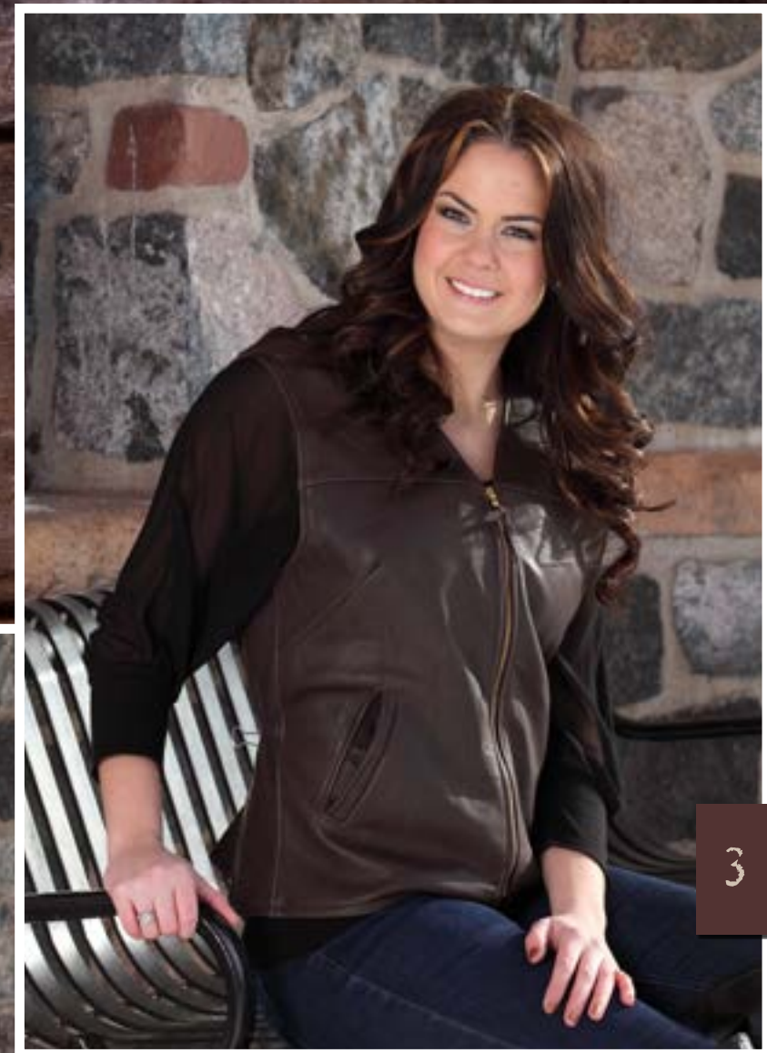
Brown Women's 24" Slender Style Vest No Collar or Yoke, Slash Pockets, Zipper 3-4 Deer or 1 Elk $395

Our prices are for manufacturing only. This does not include the cost of hides or tanning.